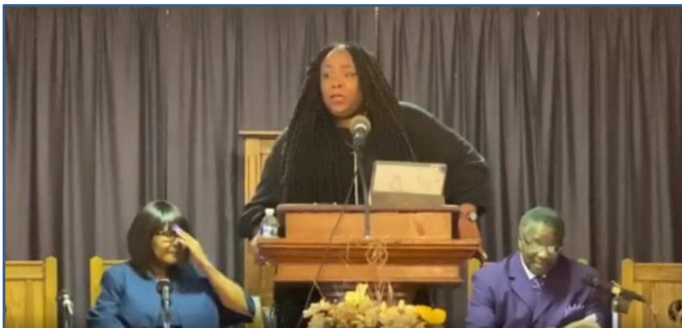
Minister Engracia McIlwaine